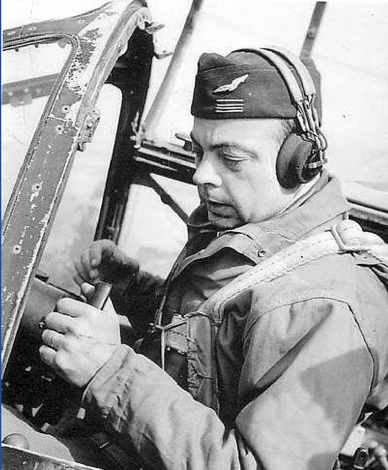
Antoine de Saint Exupéry