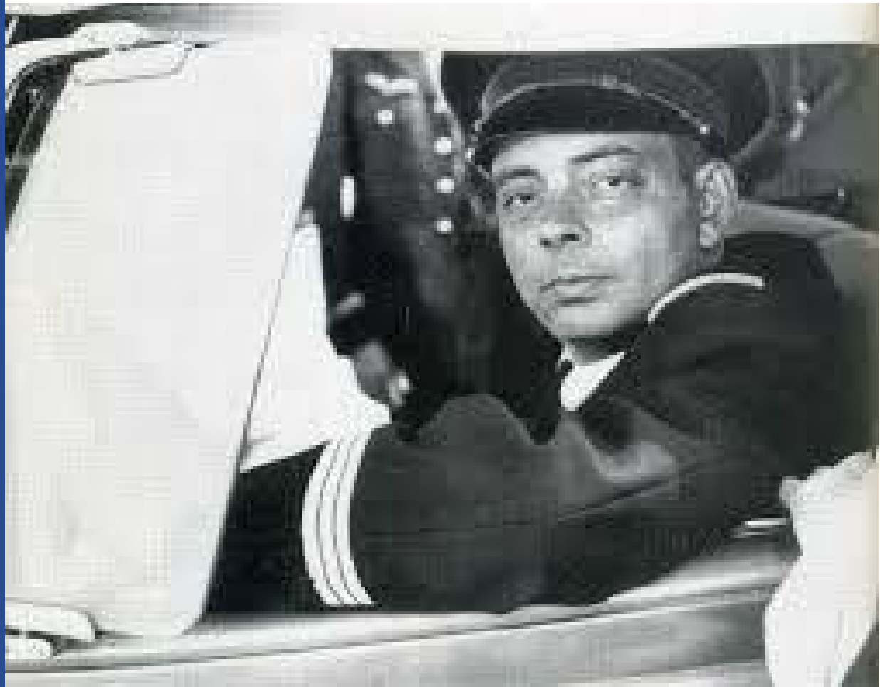
Antoine de Saint-Exupéry ( born in Lyon, 29 June 1900 – died in the